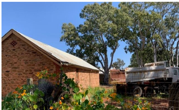
Front Barn, Romalo House