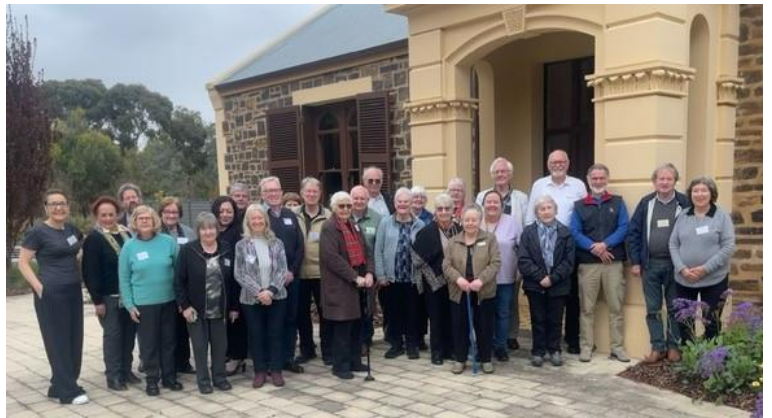
Seminar participants outside Lochend House

On Saturday 21 September the Campbelltown Historical Society hosted the 17 th Eastern Region History Seminar at the historic Lochend House. Burnside, East Torrens, Mt Lofty, Mitcham, Tea Tree Gully and Campbelltown Historical Societies, along with the Pioneers Association of SA, were all present and showcased their activities of the past 12 months. It was most interesting and enjoyable to learn of the achievements of our neighbouring historical societies and to network with them. Congratulations to the Campbelltown Historical Society for organising this very successful event.