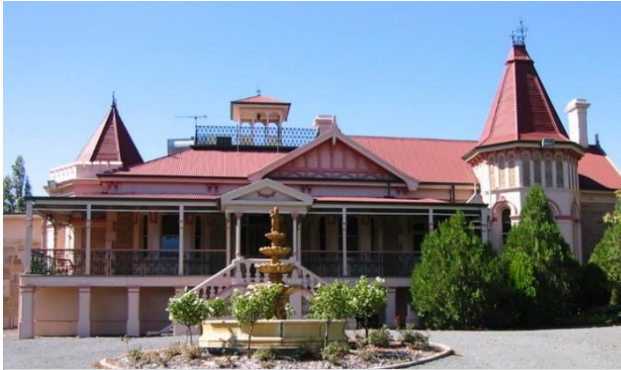
Fernilee: Gone but not completely forgotten