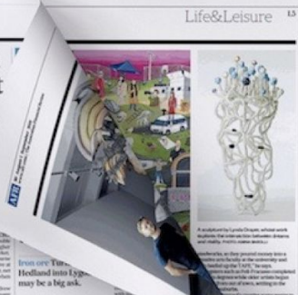
Iron ore tycoon Fort Holland may be a big ask.