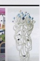
A sculpture by public artist, which stands in the city's central business district.